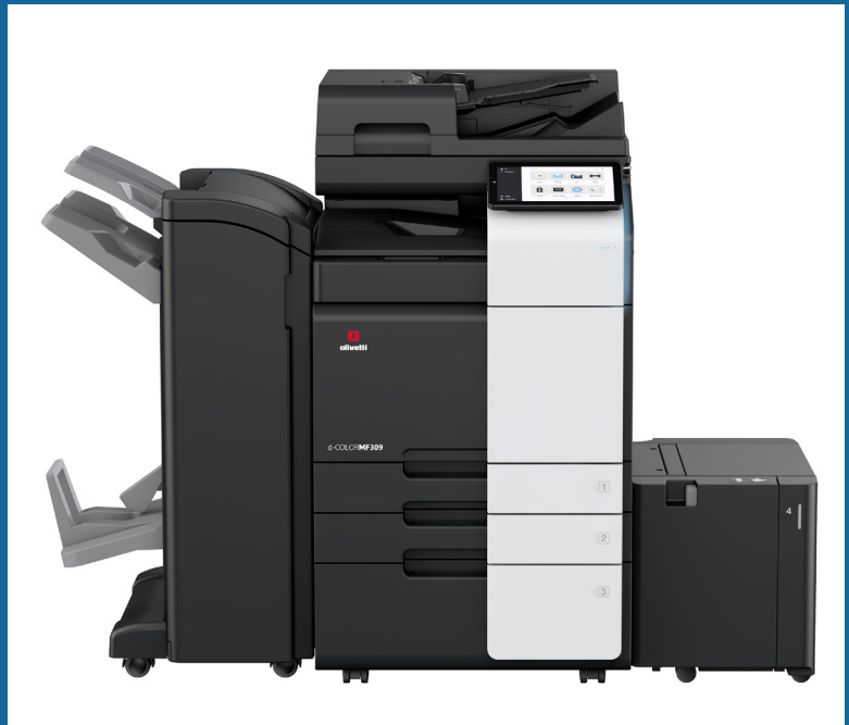
d-Color MF309 with DF-714+PC-416+LU-302+RU-513+FS-536SD

New 10.1" multi-touch operator panel, which can vibrate to provide greater touch sensitivity